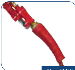
New FLEX-Grip bends with hose.

The "Pro-Flex" and "Cold-Flex"-Series Aircoils include a unique, robust, FLEX-Grip device that gives the user a color-coded, easy-to-grasp handle. Unlike other grips, this specially formulated elastomeric device is tapered, providing lasting kink protection along the section of the line that is most prone to kinking. This new factory-assembled FLEX-Grip is available on the Trailer leads for gladhand connections or on both the Trailer and Tractor leads offering kink resistance at both connection points.