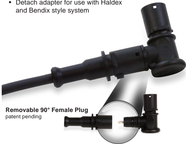
Removable 90° Female Plug patent pending